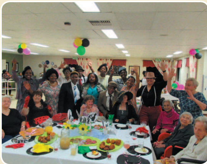
The hosts of the Sophiatown-themed Happy Hour – Ron Smith Care Centre River Lodge One staff and residents.

The residents and staff were treated to a wonderful Happy Hour event on March 27. The designated hosts of the evening were the staff and residents of River Lodge One, and they planned, plotted and prepared for the Happy Hour with the intention of celebrating the music, dance, food and culture of Sophiatown in the 50s.