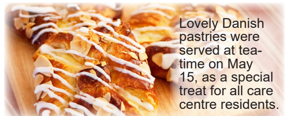
Lovely Danish pastries were served at tea-time on May 15, as a special treat for all care centre residents.