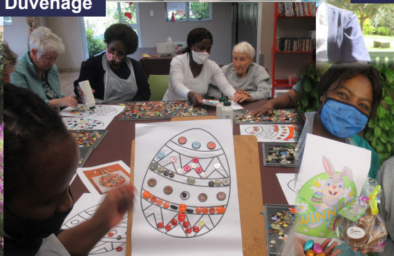
Staff and residents